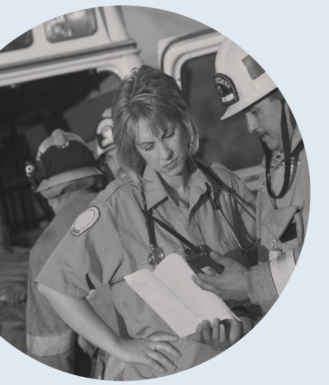
CSTE COUNCIL OF STATE AND TERRITORIAL EPIDEMIOLOGISTS